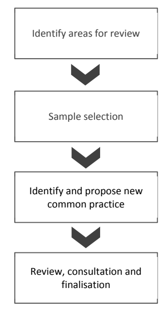
Figure 3 Process followed to identify common practice elements for inclusion in the IFRS Taxonomy